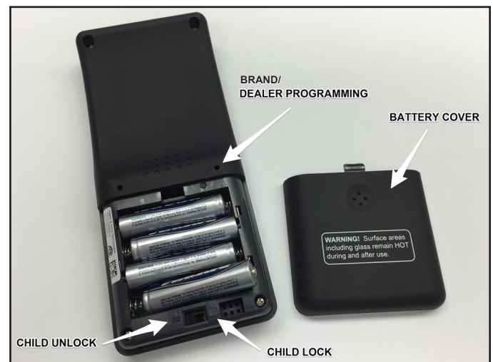
Figure 1. Install Batteries & Child Safety